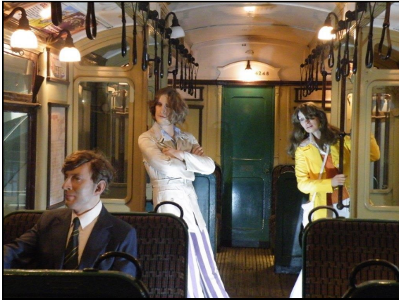
London Transport Museum - Old Tube Carriages

The London Transport Museum revived many (perhaps too many) memories, although the horse drawn & externally-staired trams & buses were outside even our direct experience. Many exhibits were accessible, some interactive (for the U1A among us) & informative back-up was provided on bus & tube services from their early days.