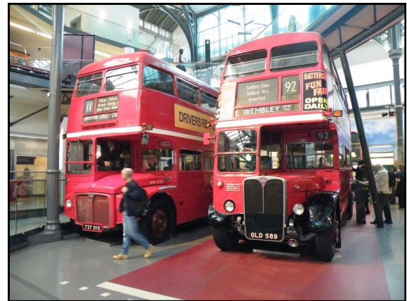
London Transport Museum - Routemaster Buses