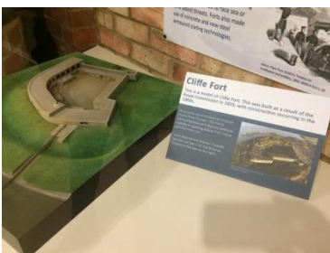
Model of Cliffe Fort.

Their role in building and defending the British Empire using the latest technologies available are displayed in the next galleries. One example is the Brennan torpedo, this was wire guided using a land based steam engine. One was installed at Cliffe fort to sink enemy shipping coming up the Thames. The remains of the launch track can still be seen at the fort today.