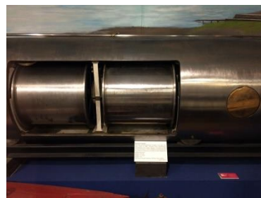
Brennan torpedo showing the drums holding the guiding/propelling wires.