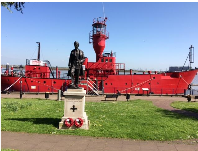
Light Vessel LV21

A most interesting visit on our own doorstep.