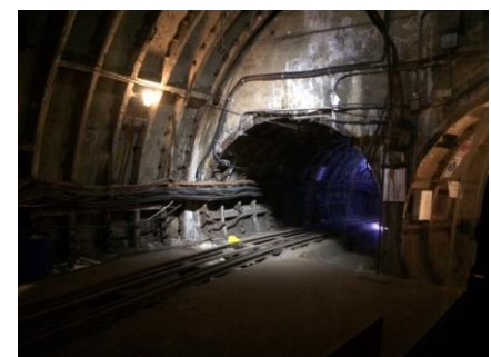
Mail Rail Tunnel