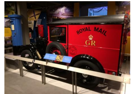
Royal Mail Van

There were plenty of exhibits, films and interactive displays to keep us occupied in the museum.