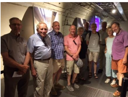
Waiting to board

After the ride we explored the Mail Rail museum to discover the history of the 6 mile long network of tunnels that linked London’s Mail Sorting Offices with Main Line stations and the driverless trains that ran through them.