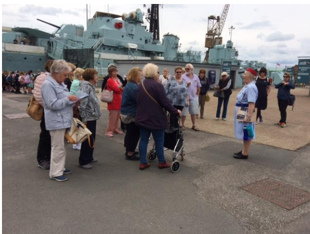
Call the Midwife tour