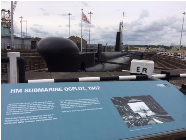
HM Submarine Ocelot

The site is enormous with plenty of vessels to explore and exhibitions to visit, towards the end of our visit we were able to see a fly past of Dakotas on their way to France for the 75 th anniversary of D-Day.