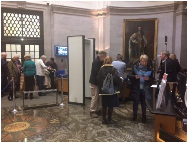
Security checks at the Bank.

At 3pm, we attended an hour-long, private presentation called the Bank of England – Past & Present. This audio-visual presentation gave us a brief history of the Bank of England since it was founded in 1694 and describes its main role and functions today.