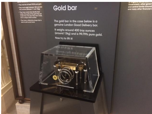
Gold Bar (You can try to lift it!).